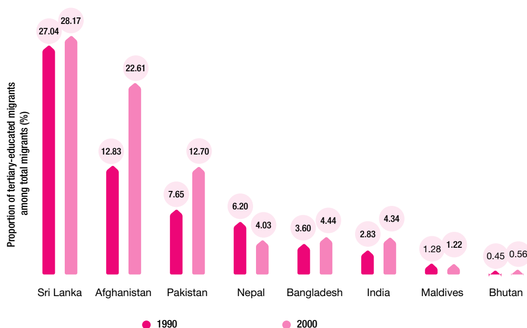
FIGURE 2: MIGRATION OF TERTIARY-EDUCATED EMIGRANTS FROM SOUTH ASIA, 1990–2000