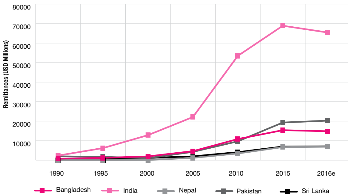
FIGURE 3: TRENDS IN REMITTANCE INFLOWS IN SOUTH ASIA, 1990–2016

Note: The figure includes major remittance-receiving countries only. For 2016, the data is available up to October 2016. Afghanistan is excluded because of lack of data.